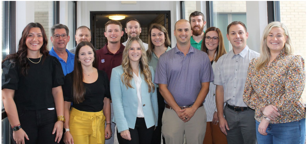
Developing Professionals Program inaugural class of 2023.

Agriculture Academy: (formerly CropLife Ambassador Network) During the 2022-2023 school year more than 7,000 students learned about agriculture from one of more than 200 ambassadors.