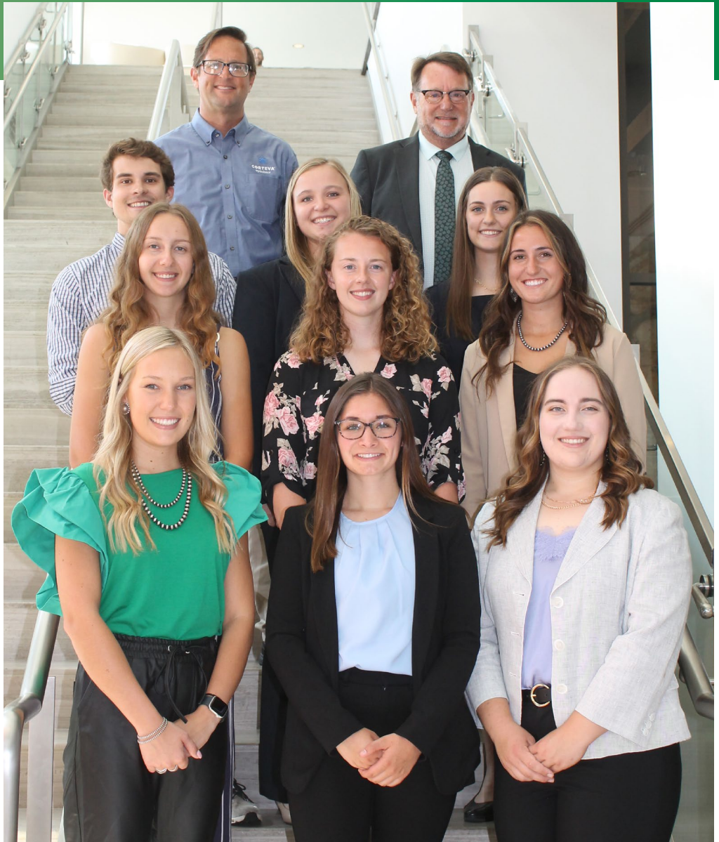
The Young Leader Scholarship Program recipients of 2023 attended the Annual Meeting.